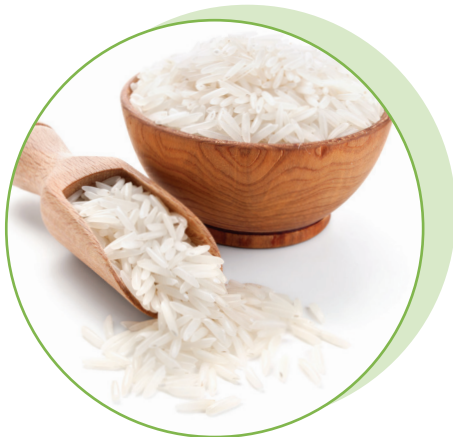
Basmati & Sella Rice